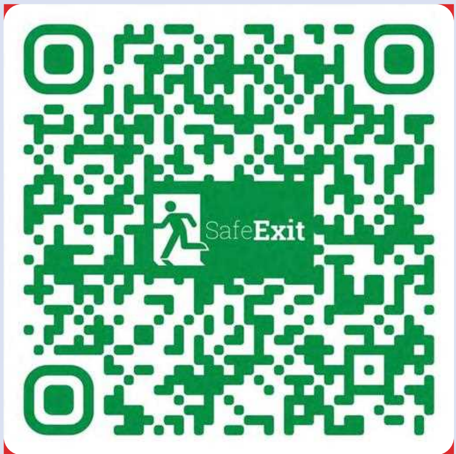
Safe Exit , digital still, 2021, mixed-media installation.